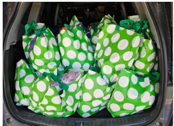
Mother and Baby Welcome bags

The Fort McKay Metis Nation had a number of interesting projects that they have carried out, one of them being a "Healing in the Kitchen" workshop series.