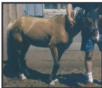
LITTLE MAN—dun—?12.2 hh? 1997 Smokey x Ahneen