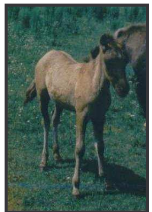
OOPS! ~~ Mattawa Dun colt— 2 May 2002 Anoong x Little Man

Financial compensation, if applicable, is to be negotiated between individual parties.