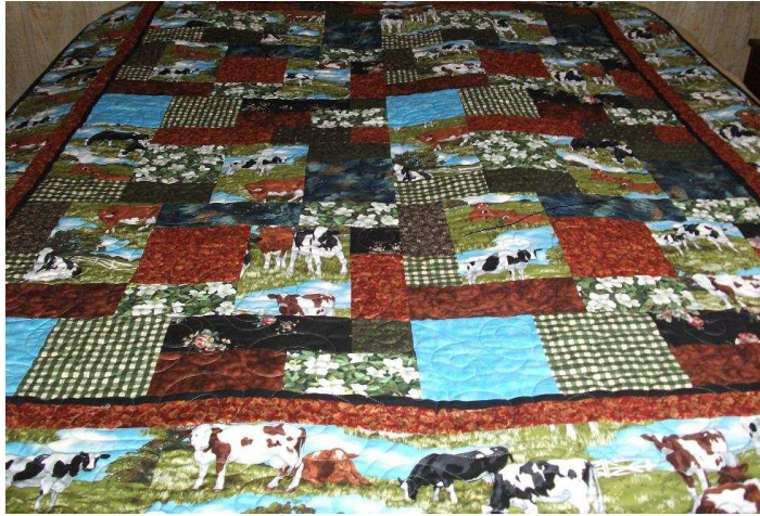
1st Prize—Lap/Twin Handmade Quilt