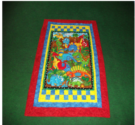
3rd Prize—Handmade Crib Quilt